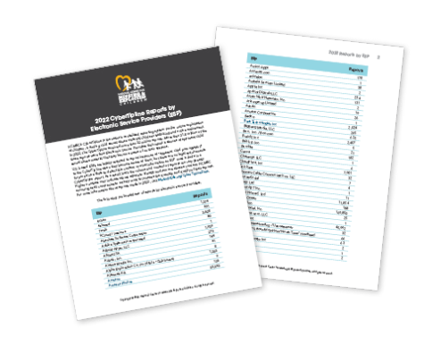
2022 CyberTipline Reports by Electronic Service Providers (ESP)

The CyberTipline receives reports from the public and online electronic service providers (ESPs). To date more than 1,500 ESPs are registered to make reports, and 17% of these are non U.S. based companies who voluntarily choose to report to the CyberTipline. In 2022, only 236 companies actually submitted CyberTipline reports and just 5 ESPs (Facebook, Instagram, Google, WhatsApp, and Omegle) accounted for more than 90% of the reports.