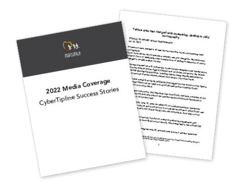
2022 Media Coverage CyberTipline Success Stories

In previous years, sextortion offenders were more likely to target young girls with a goal of obtaining additional explicit images. In 2022, we saw a large increase in boys being blackmailed for money instead of images. NCMEC analysts have analyzed reports of financial sextortion to provide insights about the victims and offenders that can be used to create prevention resources and support law enforcement efforts to respond to these crimes.