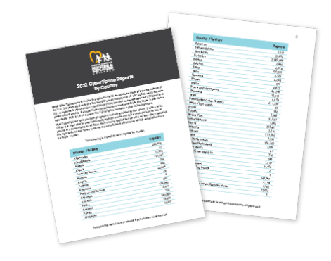
2022 CyberTipline Reports by Country

Most CyberTipline reports of CSAM include indicators of where the files were uploaded. It is important to note that country-specific numbers may be impacted by the use of proxies and anonymizers. In addition, each country applies its own national laws when assessing the reported content. These numbers are not indicative of the level of child sexual abuse in a particular country.